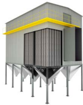
BAG HOUSE NI-100 / NI-250